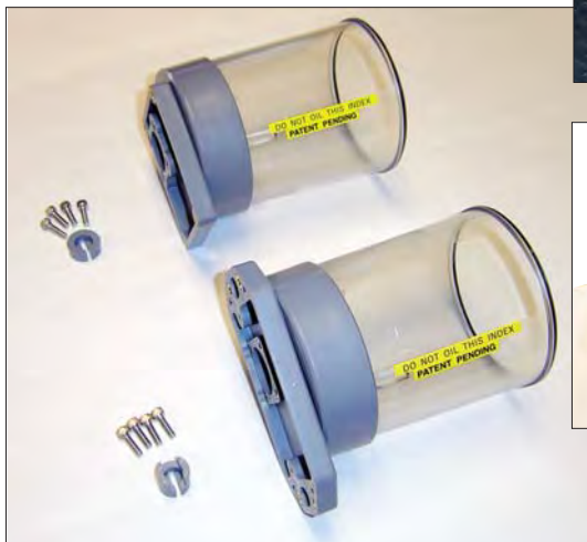
AMR Adapters for Series B3 ROOTS Meter.